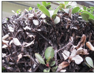
Indian hawthorn ( Raphiolepis indica ) showing black sooty mold and die-back from a heavy infestation.