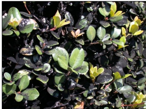
Severe black sooty mold growth on stems and leaves.