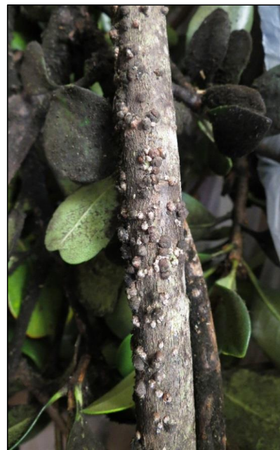
Asterococcus sp. prob. yunnanensis on the woody stem of Indian hawthorn.