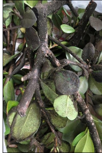
Severe black sooty mold growth on stems and leaves.