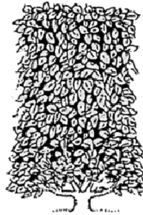
Good Shape – Lower branches get sun