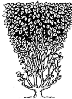
Poor Shape – Lower branches shaded from sun