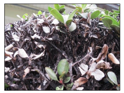
Indian hawthorn (Rhaphiolepis indica) showing black sooty mold and die-back from a heavy infestation.