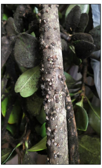
Asterococcus sp. prob. yunnanensis on the woody stem of Indian hawthorn.