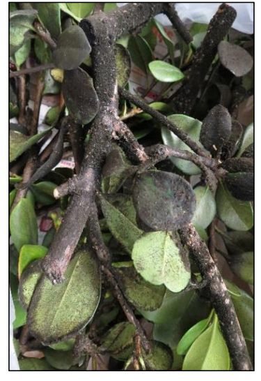
Severe black sooty mold growth on stems and leaves.