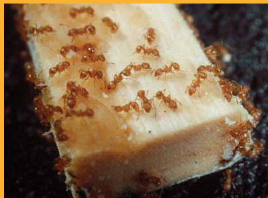
Little fire ants on the big end of a chopstick

A Tiny New Stinging Ant Spreading Across Hawai'i