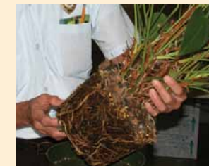
Carefully inspect plants before transporting them

Eradication is being attempted on Kaua'i and Maui. On Hawai'i, where there are numerous infestations, limited agency resources and personnel make it virtually impossible to eradicate this pest or conduct adequate control programs. The public's help is essential in detecting the little fire ant where it is not yet known to be present and in assisting with serious, sustained efforts to control this pest on private properties.