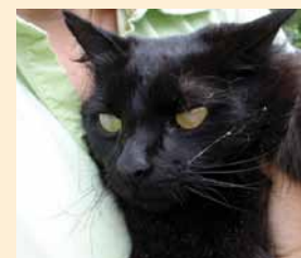
Pet with clouded corneas

In the Galapagos Islands, LFA prevent workers from harvesting coffee. While no serious injuries to people from LFA stings have been reported, those who might have an anaphylactic allergic reaction could suffer serious harm. Pets, livestock and wild animals are also at risk for LFA stings. Multiple stings in the eyes can result in blindness by secondary infection or even the death of newly born or small animals.