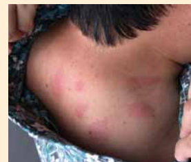
LFA easily fall from trees and get under clothes

LFA are found both on the ground and in vegetation. They climb onto plants of all sizes, including trees, but they easily fall off when the plants are disturbed. Activities such as pruning branches, harvesting fruit, or picking flowers in infested areas can cause LFA to rain down in large numbers. Some orchard workers in East Hawai'i have quit their jobs because of this.