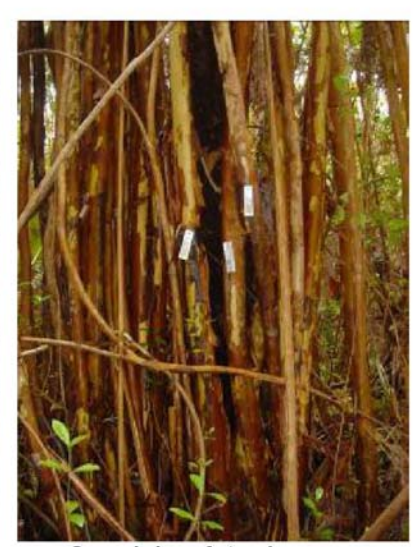
Ground view of strawberry guava thicket in Ola`a Forest Reserve