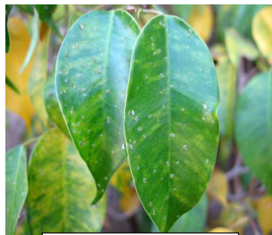
Adult and immature whiteflies on affected leaves