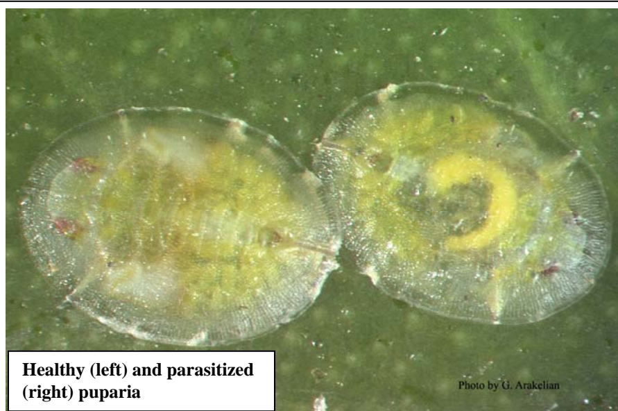
Healthy (left) and parasitized (right) puparia