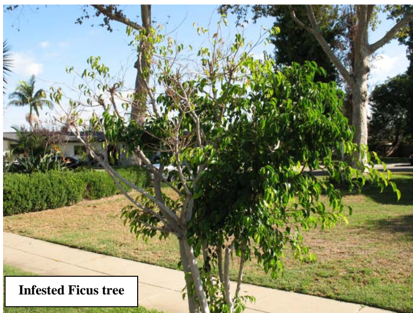
Infested Ficus tree