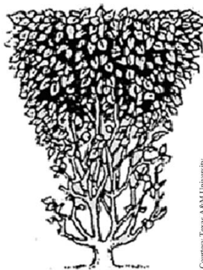
Poor Shape – Lower branches shaded from sun